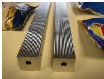
Crimped profile sealing jaws matching pair. Normal size 25mm x 650mm but can be anywhere from 5mm up to 25mm wide x 650mm long.