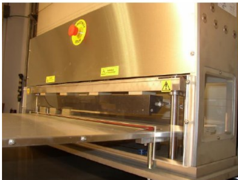
Enclosed construction with guided sealing bar