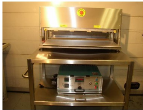
Control panel and sealing head mounted to stainless steel trolley (optional)