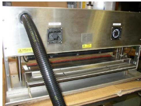
Rear of machine wing ABS electrical conduit connection