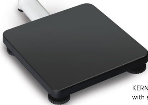
KERN MPS-PM with stand