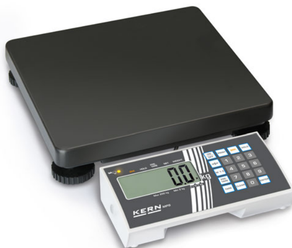
KERN MPS-M with free-standing display device